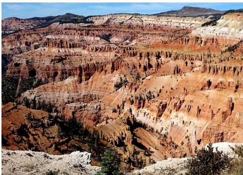
Cedar Breaks National Monument

Day 4 Wednesday 9/22 As we begin our travel homeward, we stop in the internationally renowned city of Las Vegas , often thought of as the entertainment capital of the world. Las Vegas is a city famous for its gambling, shopping, sight-seeing, shows and fine dining. After our stop in Las Vegas, we reflect on all of the amazing sights we have seen as we head for home in the comfort and convenience of the deluxe motorcoach.