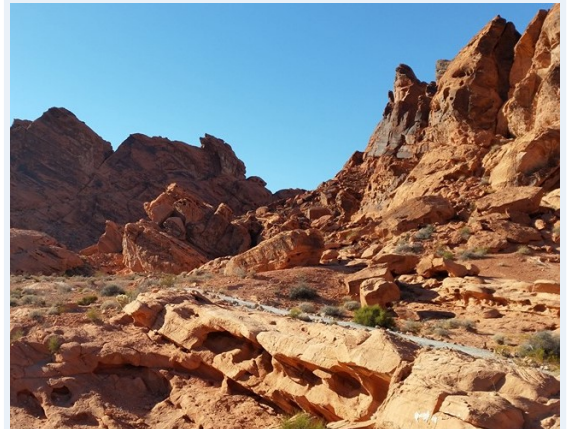
Valley of Fire

$669 Per Person, Double Occupancy $799 Single Occupancy